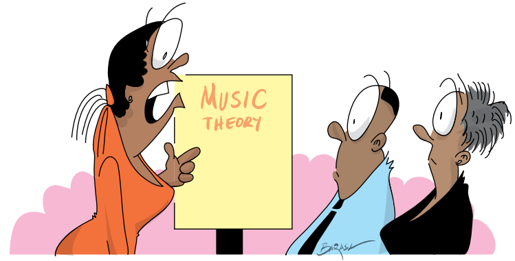
"Like music is food to our souls, so are taxes food to our economy."

are in general associated with low levels of tax revenues due to limited support for revenue- raising efforts, low quality of government institutions, and ineffective and unaccountable governments characterised by an absence of representation for taxpayers in the tax policy process. These arguments lead to the conclusion that taxation is a necessary condition for the quality of governance (Moore 2008, OECD 2008).