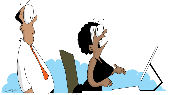
"Why do they call it tax returns? I think it's because it returns to make our lives better..."

and predictable, governments would have incentives to foster their citizens' prosperity, thus generating more revenues (Moore 2008, OECD 2008).