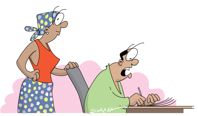
"They say that the truth hurts... But when filling tax return forms we should tell the truth because it's lies that will hurt..."

First, popularly elected local council, locally appointed chief officials, and locally approved budget constitute some of the most crucial requirements of a decentralized system. If local government officials are appointed by higher levels of government rather than popularly elected, they will be accountable to the centre rather than to local populations. Therefore, popularly elected local councils would ensure true downward accountability and persuade public officials to be responsive to the needs and interests of their constituents. Furthermore, if budgets are locally approved, this would require citizen participation in the decision-making processes and would therefore give citizens a voice in how their taxes should be spent and that they are spent according to their preferences. In such an environment, as citizens become an integral part of the institution and the political dialogue, they will increase their level of tax compliance, thus increasing citizens' tax ethics and a tax compliance culture.