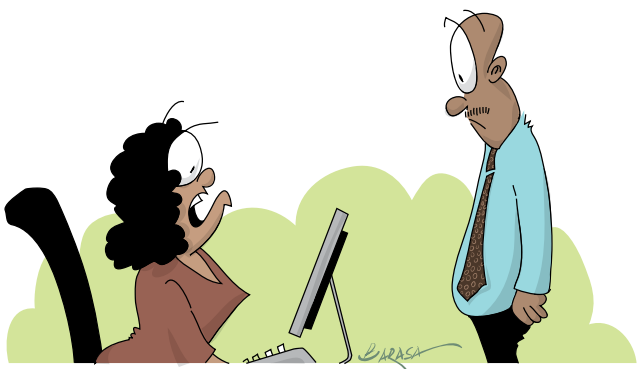
"Are you sure you want to pay lower taxes? Because the best way to do that is to reduce your salalry"